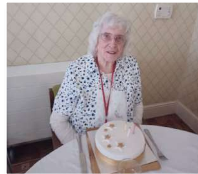
Di Acer House Care Home 101 st Birthday, 13 th March