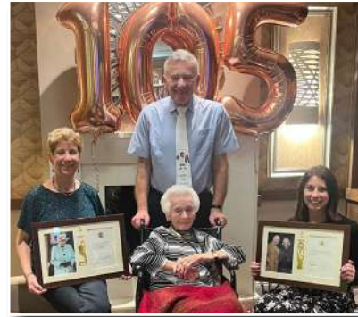
Lore Elton House Care Home 105 th Birthday, 7 th January