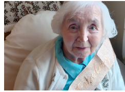
Louie Horse Fair 100 th Birthday, 3 rd March